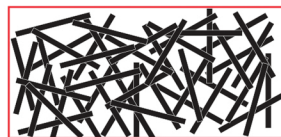
Shred Sample Size - 3.9mm x 40mm (1/8" x 1 9/16") Cross Cut Type IIIB