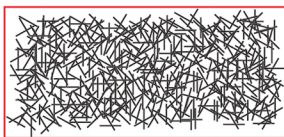
Shred Sample Size - 0.8mm x 12mm (1/32" x 7/16") Cross Cut Type II