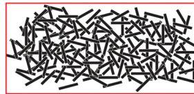
Shred Sample Size - 2mm x 15mm (1/12" x 9/16") Cross Cut Type IIIA